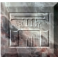
TC-CCB-200-1 TC3111 IP

Information and specifications within this brochure are subject to change without notice.